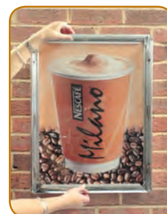
Close snapframe sides