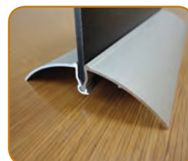
Spring-powered 'grip-action' bases