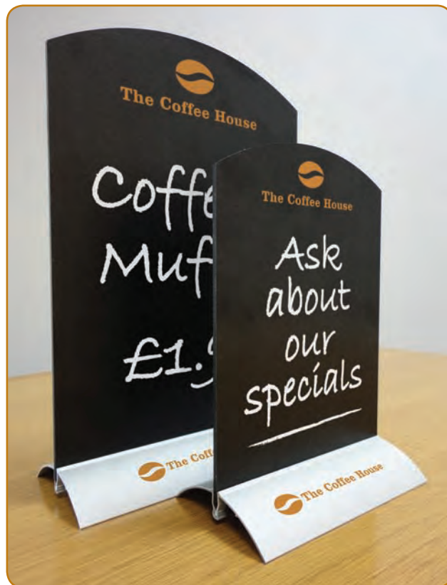
With printed panels and pad-printed bases