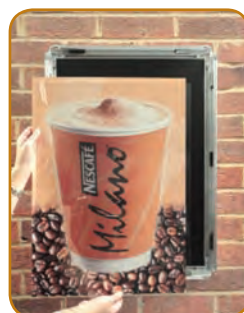
Place poster and cover sheet in front