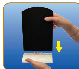
Simply grip the base open and insert the chalkboard